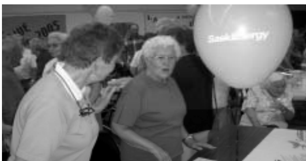
The Langbank Homecoming Celebration turned out to be a tremendous success.