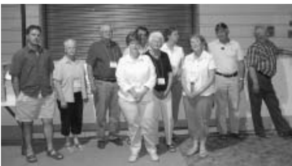
Congratulations to the Century Farm Award Recipients who were recognized at the Oungre event.