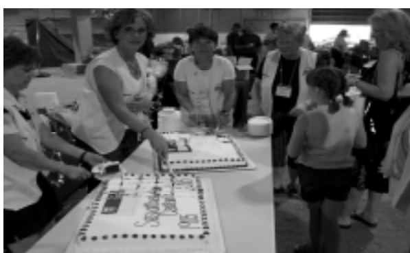
"Cutting the Cake!"