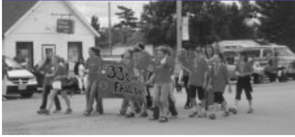
Students of 33 Central School