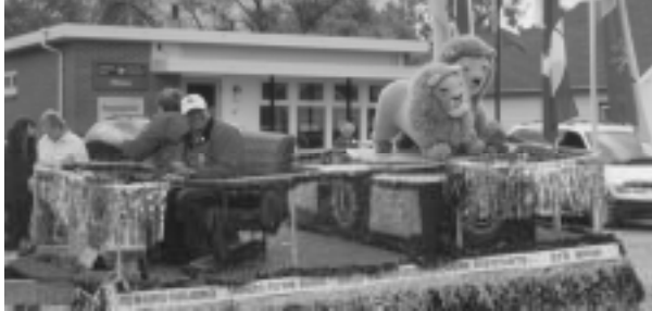
Fillmore Lions Club Float