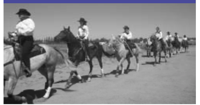
Coronach Outlaw Days Trick Riders.