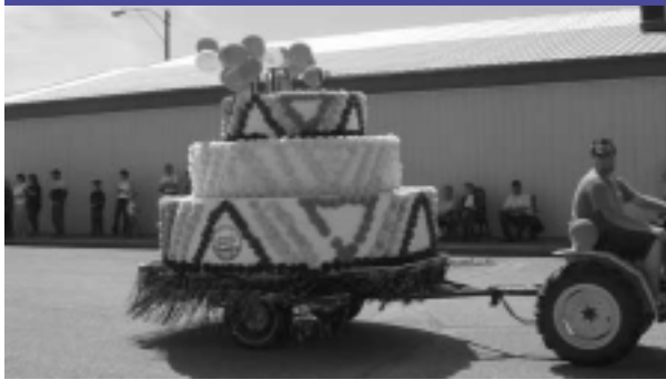
Giant Birthday Cake at the Bengough Homecoming and the Saskatchewan Centennial Celebration.